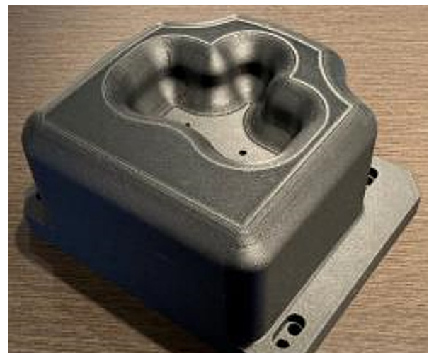
FDM Nylon 12CF punch.