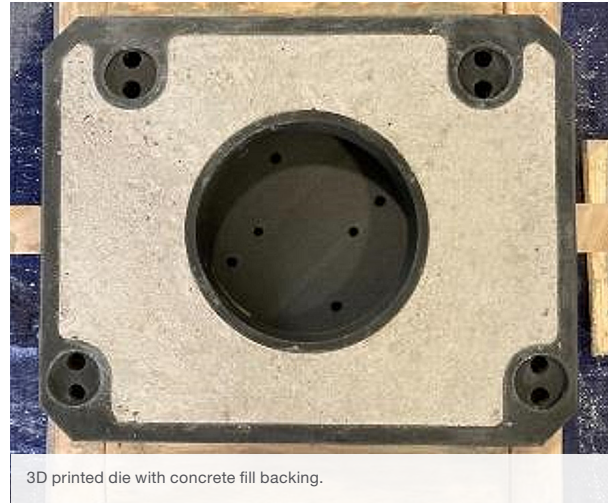
3D printed die with concrete fill backing.

The tool was used to form 1.6 mm thick dual-phase 590 advanced high-strength steel. Engineers from 99P Labs performed stress and strain analysis to validate the 3D printed tool's capability to meet the forming loads and found it acceptable with the concrete fill. Ultimately, the FDM Nylon-12CF forming tool provided successful results, yielding 40 parts, easily within the desired production target. The 3D printed solution also achieved a 65% cost reduction over the traditional machined-metal form tool option.