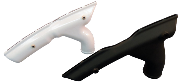
Before & after part-consolidation of defog duct nozzle

Delivered quickly, with a repeatable process and at a competitive cost per piece, 3D printing was the perfect solution for the helicopters’ ECS ducting. With the advantage of the design freedom of Laser Sintering, Stratasys Direct Manufacturing was able to deliver the complex designs quickly and at Bell Helicopter’s industry-leading quality standards.