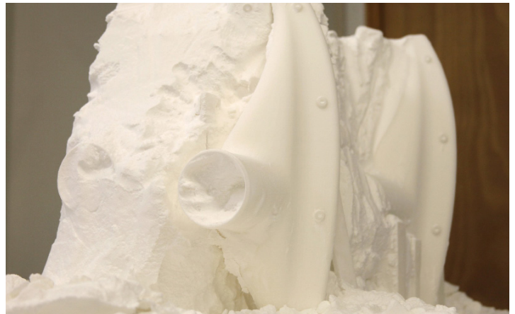
Defog duct nozzles being excavated from powder