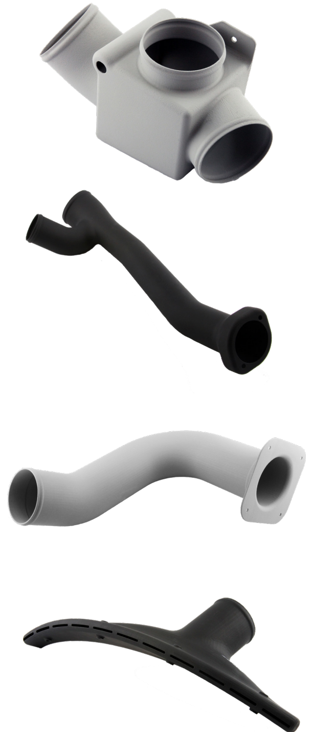
Four ECS ducting parts manufactured for Bell Helicopter.

Overall, for Bell's 429 helicopter program, there was a 24% part-count reduction when designs were converted to laser sintering, with six materials reduced and rework eliminated. The most crucial savings for the 429 program was in weight. Bell measured an overall weight reduction of 2/3 lb. for every 1 lb. of laser sintered weight.