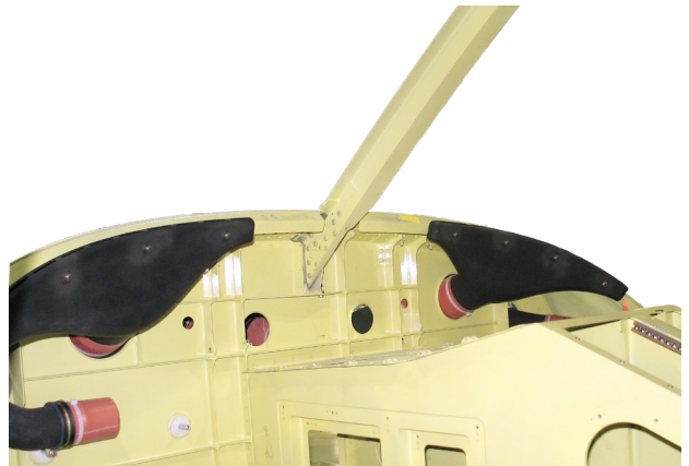
Defog duct nozzles installed in a Bell 429 helicopter