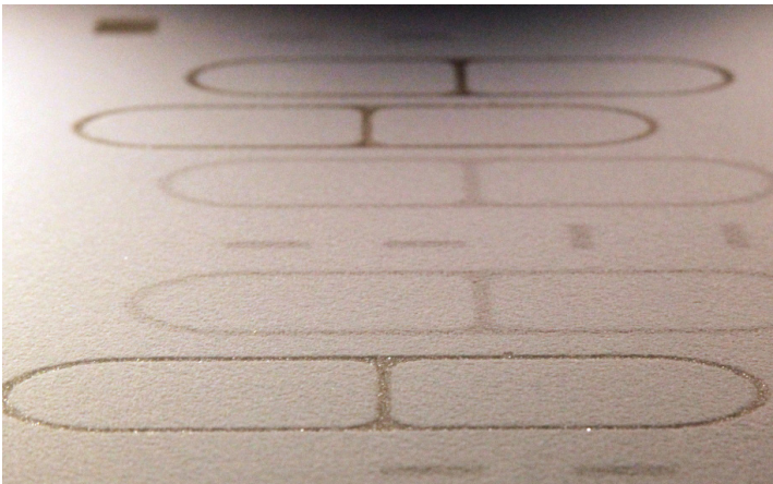
Parts and tensile bars mid-build in Laser Sintering machine

From the material used to the finished product's performance, the parts had to meet aerospace quality standards and Bell's rigorous testing processes. With the helicopter's unique weight requirements, the final pieces would have to be lightweight. Bell was also looking to maximize any available economic advantage throughout the entire process.